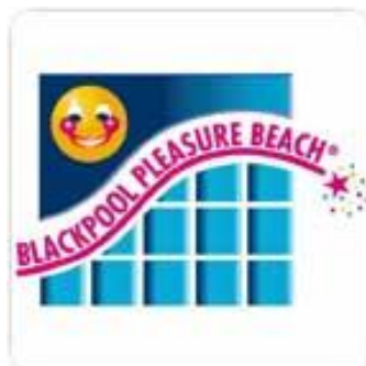
A trip to Blackpool Pleasure Beach is just one of the many activities that Carluke High School pupils will enjoy.